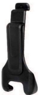
PD35X Belt Clip