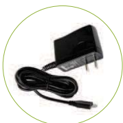
Micro USB Power Adapter (5V/1A)