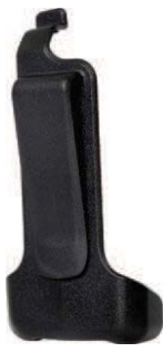
PD36X Belt Clip