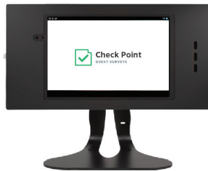
Nexus 7 Mountable Enclosure £200