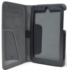
Asus/Nexus Folio £20