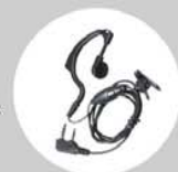
Ear-piece Mic EHK01