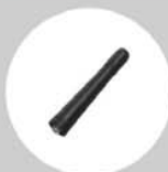
Antenna (UHF) TH-2800U AF 40047002 (400-470MHz)