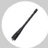
Antenna (VHF) TH-2800: AH13615006 (136-150MHz) AH 15017406 (150-174MHz)