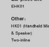
Other: HK01 (Handheld Mic & Speaker) Two-inline