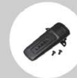
Belt Clip S03 Flexible Washer