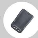
Li-ion Battery BL1600 Battery Capacity: 1600mAh