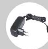
Charger Adapter NLB100120V1U INPUT:100-240V-50/60Hz OUTPUT:12V 1000mA