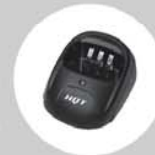
Charger CL0606 Charge Current: 600mAh